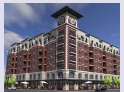
CENTRAL WEST END & MIDTOWN PAGE 2