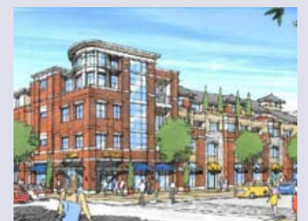
FOREST PARK SOUTHEAST, BOTANICAL HEIGHTS, TIFFANY, CHELTENHAM, KINGS OAK & SHAW PAGE 3