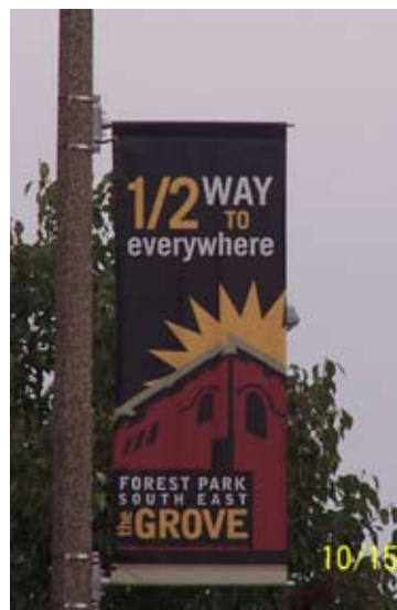
TOP: Artists put the finishing touches on a mural at Grovesfest. ABOVE: Cyclists speed down Forest Park Avenue during the last stage of the Tour of Missouri. RIGHT: A banner on Manchester promotes the Grove district in preparation for the closing of Highway 40.

Here's a roundup of news from around the 17 th Ward: