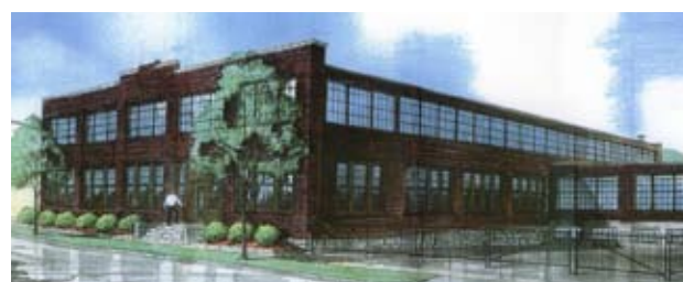
TOP: An artist's rendering of the proposed Citywalk project at Euclid and West Pine. ABOVE: The Independence Center's new renovated quarters on Forest Park Avenue.